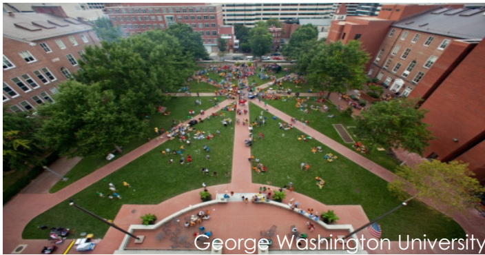
George Washington University