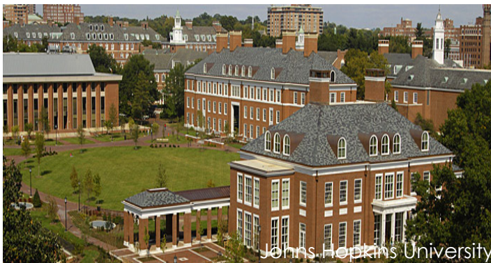
Johns Hopkins University