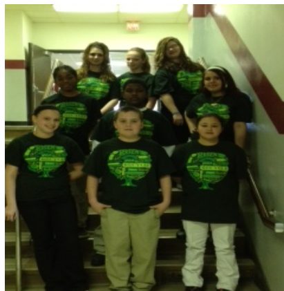
Wayne Elementary Green Team