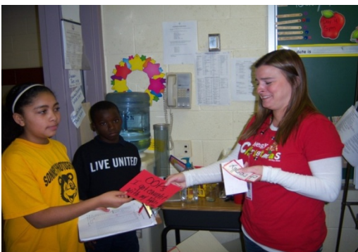
McKinley Elementary Energy Police