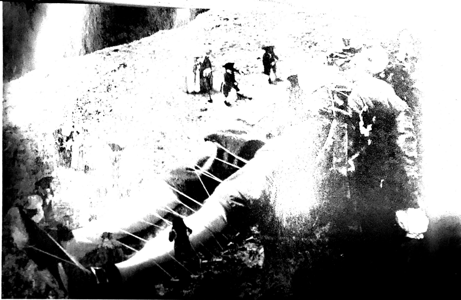
Ted Danson as Gulliver ( Gulliver's Travels, NBC, 1996).

me; and, at the same time, with a violent pull, which gave me excessive pain, I a little loosened the strings that tied down my hair on the left side; so that I was just able to turn my head about two inches. But the creatures ran off a second time, before I could seize them; whereupon there was a great shout in a very shrill accent; and after it ceased, I heard one of them cry aloud, Tolgo phonac ; when in an instant I felt above an hundred arrows discharged on my left hand, which pricked me like so many needles; and besides they shot another flight into the air, as we do bombs in Europe, whereof many, I suppose, fell on my body (though I felt them not) and some on my face, which I immediately covered with my left hand. When this shower of arrows was over, I fell a groaning with grief and pain; and then striving again to get loose, they discharged another volley 3 larger than the first, and some of them attempted with spears to stick me in the sides; but, by good luck, I had on me a buff jerkin 4 , which they could not pierce. I thought it the most prudent method to lie still; and my design was to continue so till night, when, my