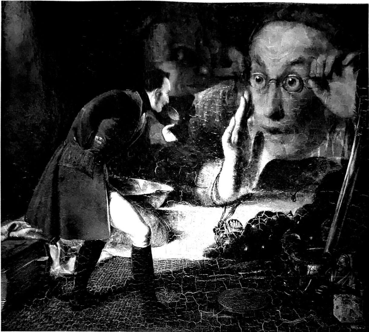
Richard Redgrave, Gulliver Exhibited to the Brobdingnag Farmer ; Victoria and Albert Museum, London.

For, upon some words he spoke, they went to reap the corn in the field where I lay. I kept from them at as great a distance as I could, but was forced to move with extreme difficulty, for the stalks of the corn were sometimes not above a foot distant, so that I could hardly squeeze my body betwixt them. However, I made a shift to go forward till I came to a part of the field where the corn had been laid by the rain and wind; here it was impossible for me to advance a step, for the stalks were so interwoven that I could not creep through, and the beards of the fallen ears so strong and pointed that they pierced through my clothes into my flesh. At the same time I heard the reapers not above an hundred yards behind me. Being quite dispirited with toil, and wholly