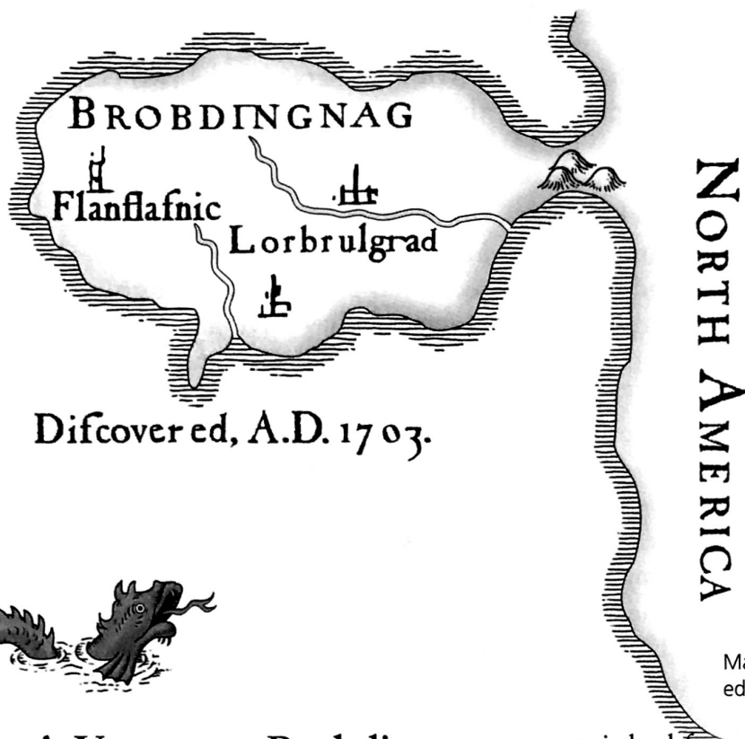
Map of Brobdingnag from the first edition of Gulliver's Travels , 1726