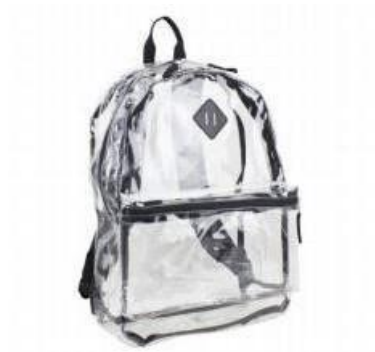
Example of permitted clear backpack.

All bags, including backpacks, purses, duffle bags, fanny packs, cross body bags, satchels, carried by students in grades PreK-12 must be clear. Students participating in an extracurricular activity are permitted to carry non-transparent bags to store items pertaining to their particular activity (i.e. band, athletics, etc.). Upon entry into the school, all extracurricular activity bags must be stored in lockers or designated areas. All bags are subject to search. Additionally, the maximum size for non-transparent bags that students will be permitted to carry during the school day, such as lunch kits, pencil bags and purses, will be 6" x 9".