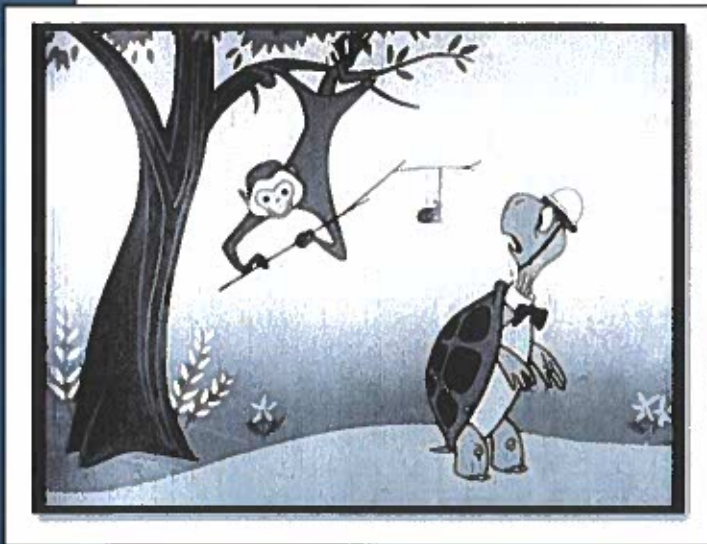
Duck and Cover (1951) Bert the Turtle video YouTube video link https://www.youtube.com/watch?v=IKqXu-5jw60