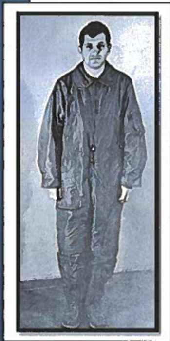
Soviet photograph of Powers