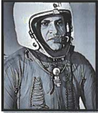
Francis Gary Powers